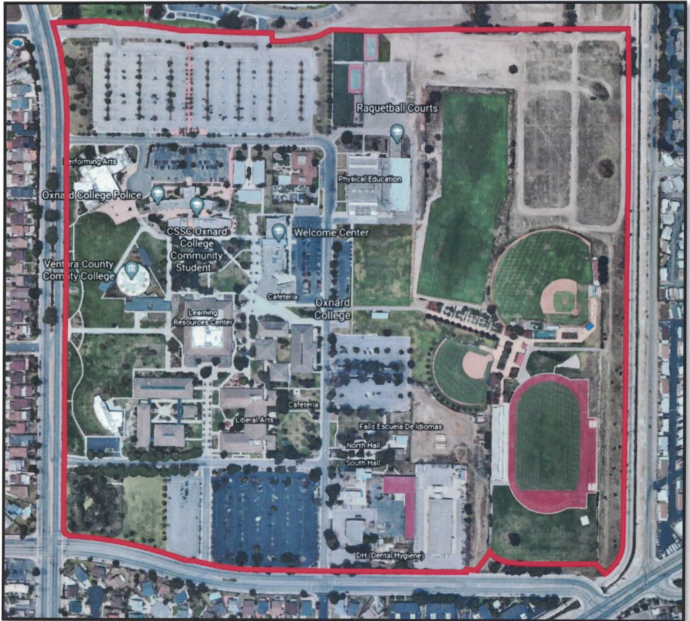
Appendix A. Satellite Imagery of Oxnard College with geographical boundaries superimposed.